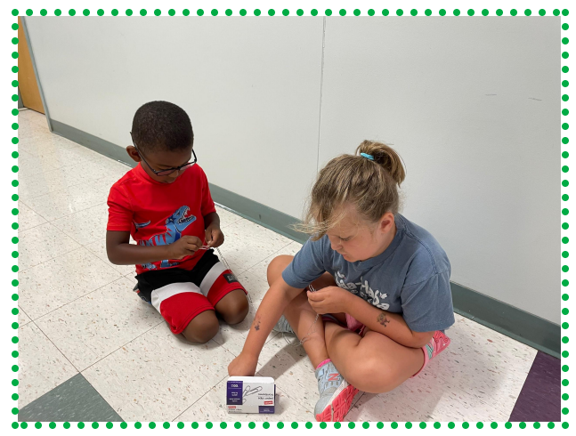
K/1 Cooperative Learning

In addition, middle school students will have a class focused on the Habits of Learning and goal setting. Check out your middle school students' agenda book for their weekly goal and talk with them about how you can support their success. This month we will be focusing on learning the <u>WOOPS</u> method of goal setting . . . check it out. You might even want to join them in setting some WOOPS goals of your own.